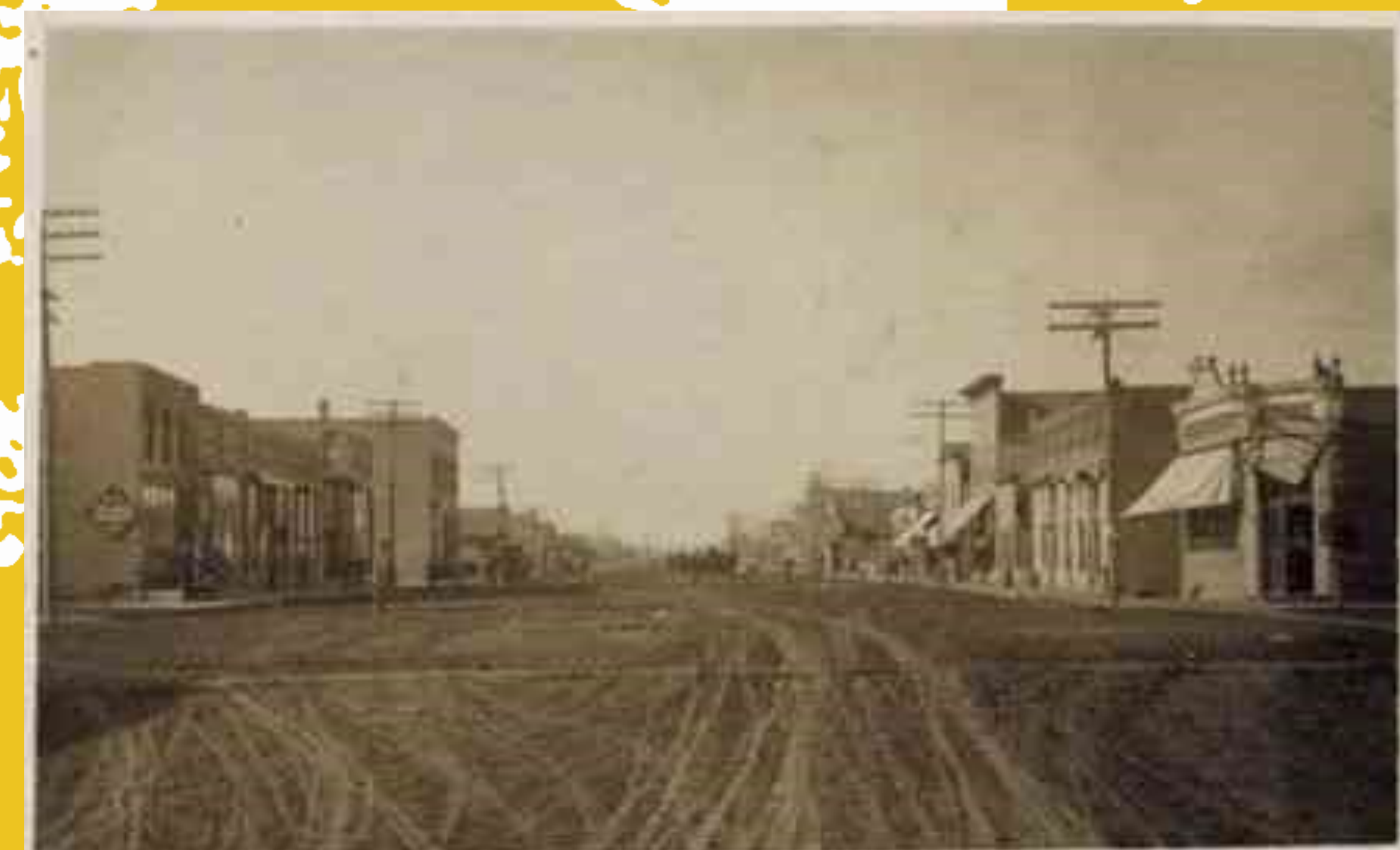
Photo of Main Street, Osmond, Nebraska 1909