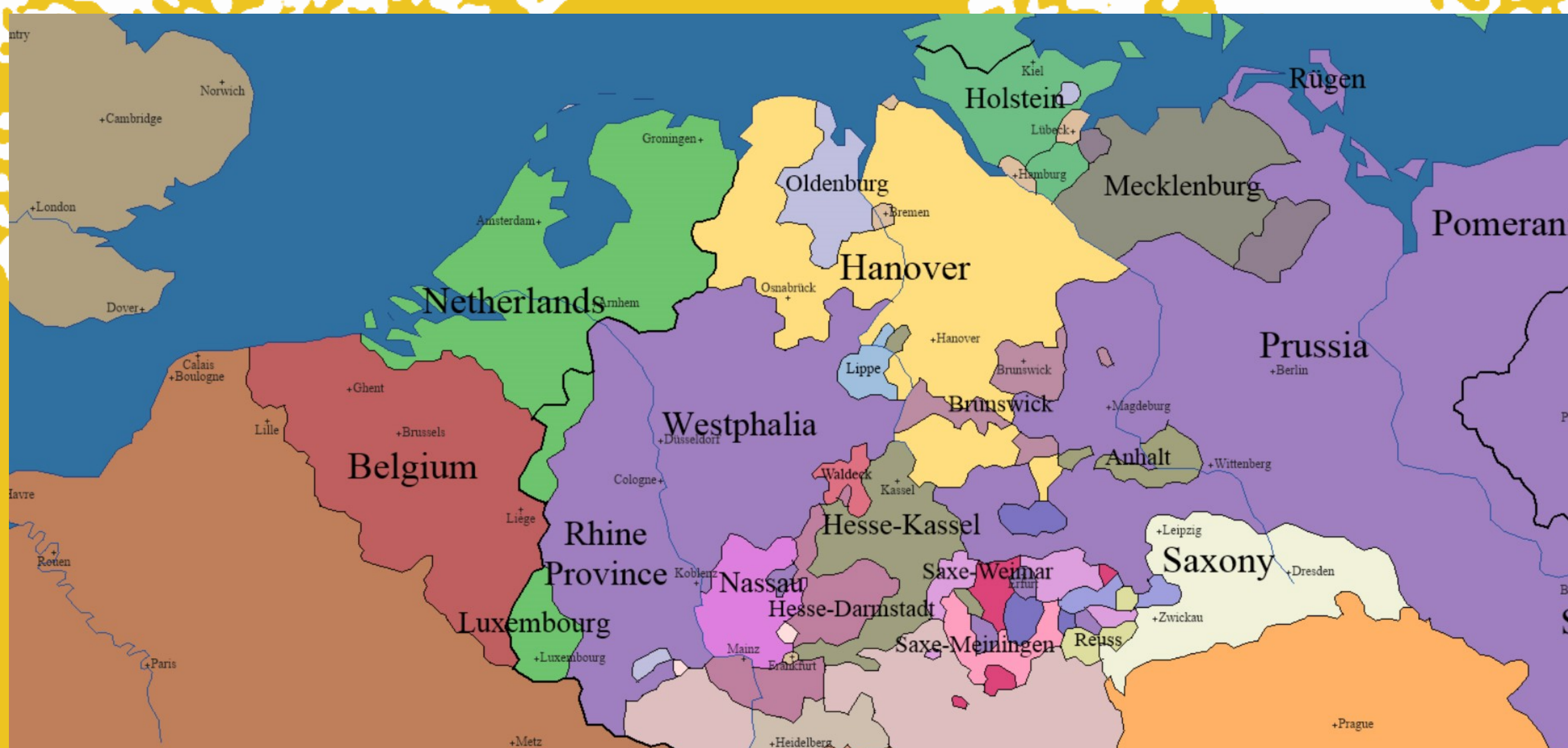
Map of Central Europe, 1859